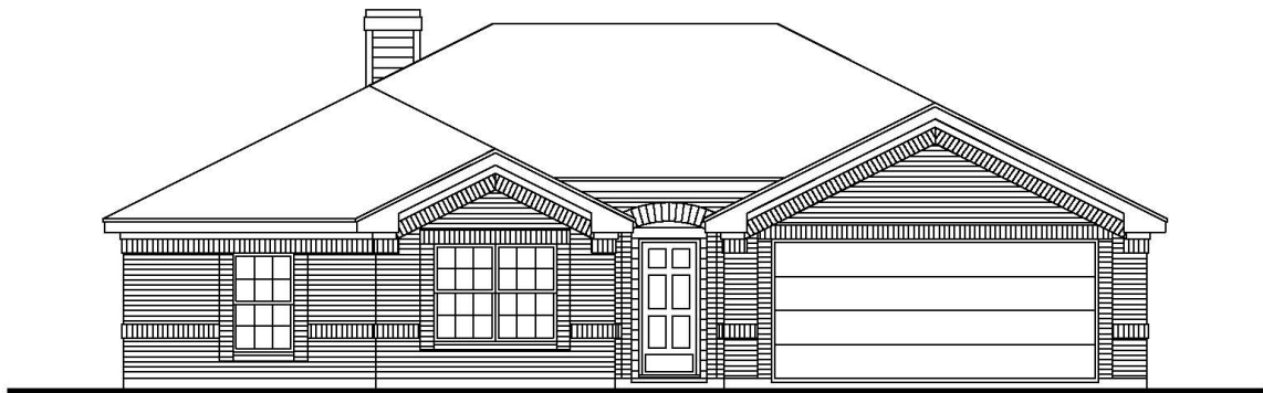
FRONT ELEVATION "C"